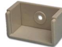
Plastic End Cap