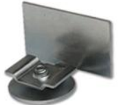
Heavy Duty Metal End Cap