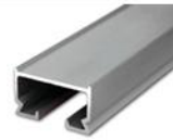
8000 Series Cubicle Track